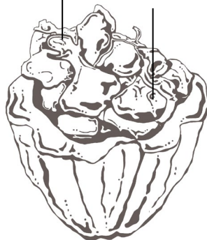
Cut Cacao Pod

Needs to be fermented and sun dried, then delicious. See fig 3.